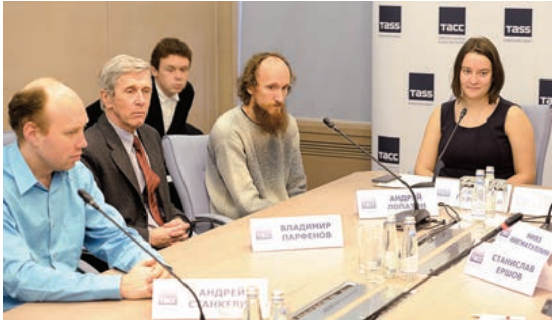
Visiting the journalists.