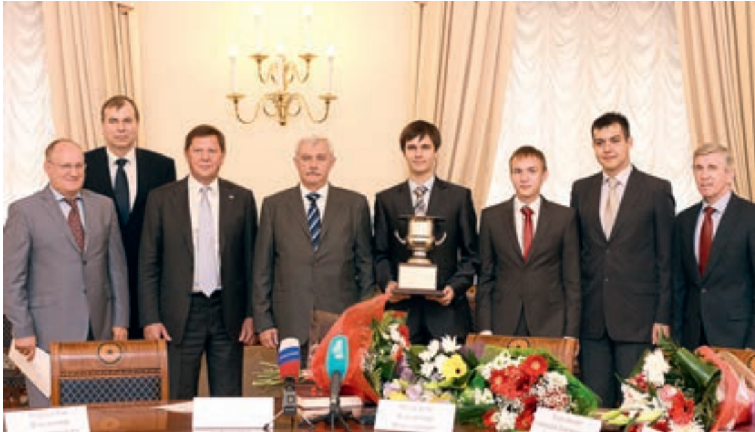
The 2015 world champions were received at Smolny by Governor Georgy Poltavchenko.