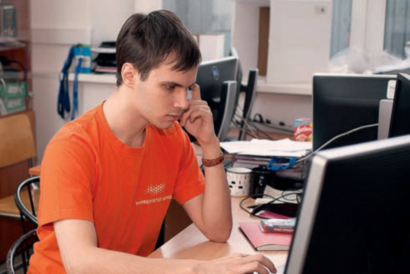
The tourist plans his route.